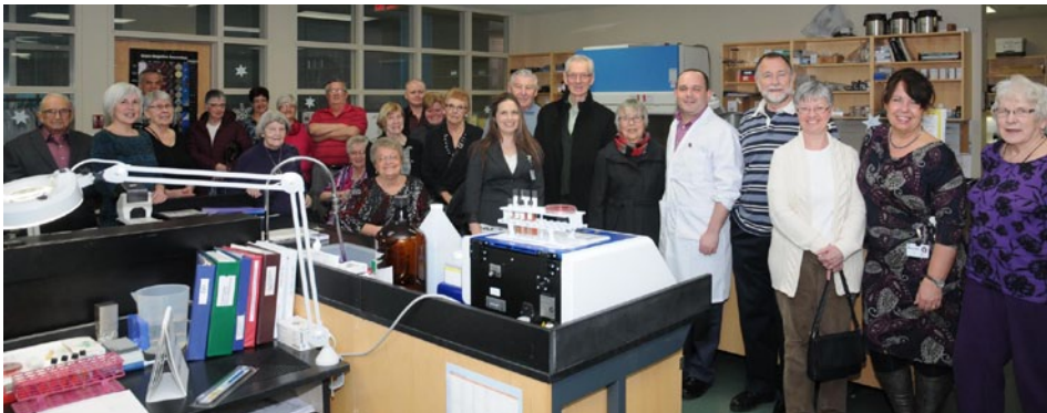
This group of Faithful Friends was delighted to see the revolutionary Bacteria Identification Technology up close and personal.